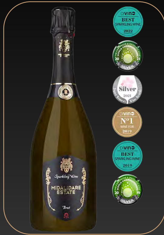
Midalidare Deluxe Brut NV