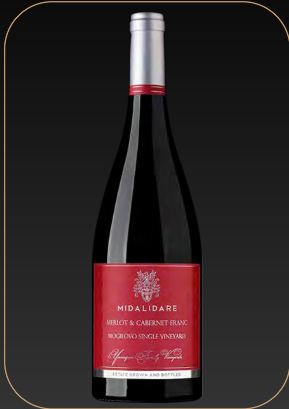
Midalidare Merlot & Cabernet Franc Regular & Half