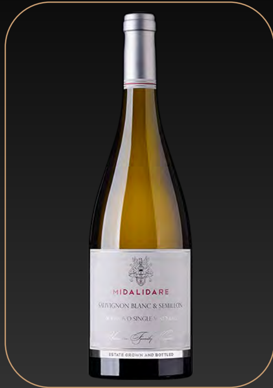
Midalidare Sauvignon Blanc & Semillon