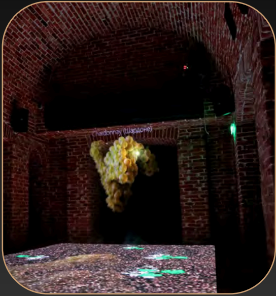
Interactive presentation of sparkling winemaking