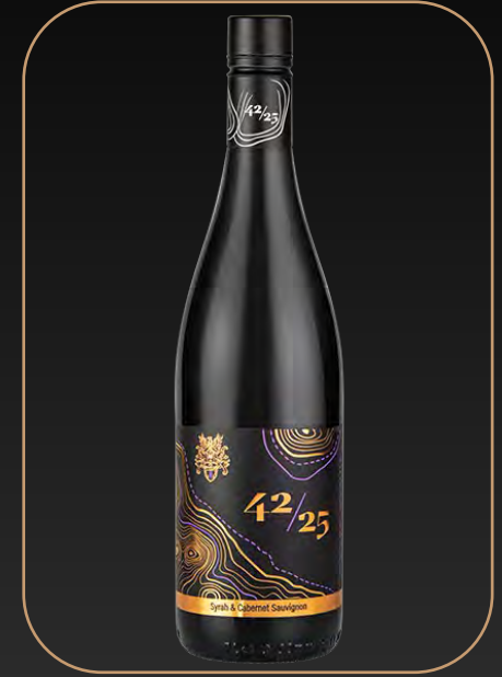
42/25 Syrah & Cabernet Sauvignon