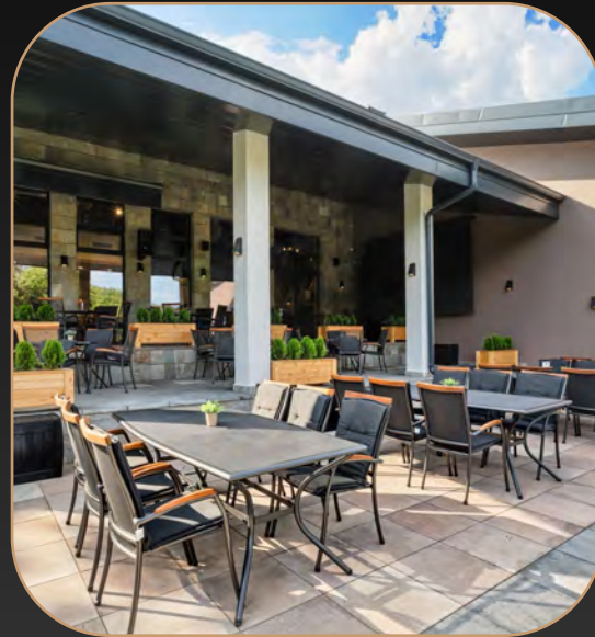
Midalidare Gastro Pub