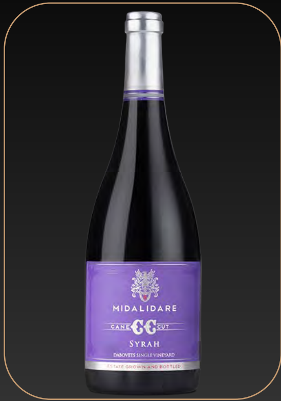
Midalidare Cane Cut Syrah