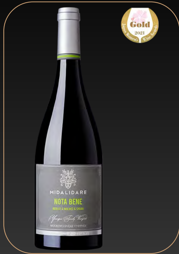
Nota Bene Merlot & Malbec & Syrah