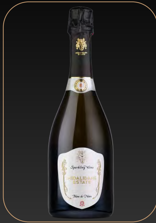
Midalidare Blanc de Noirs NV