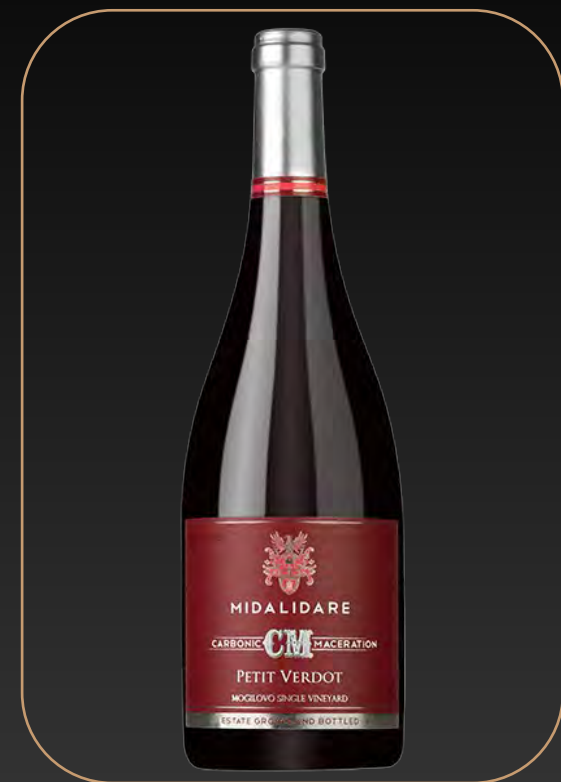
Midalidare Carbonic Maceration Petit Verdot