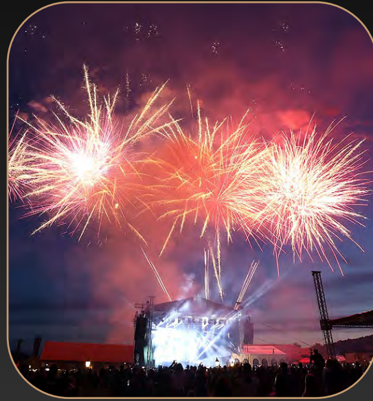
Midalidare Rock In The Wine Valley