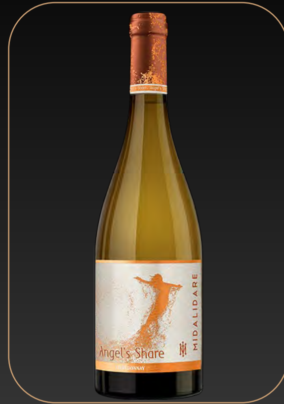
Angel's Share Chardonnay Regular & Half