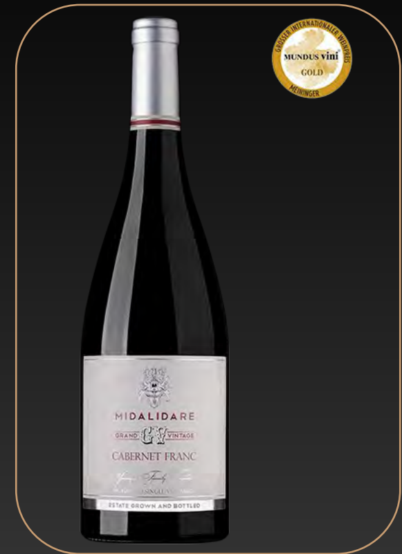
Grand Vintage Cabernet Franc Regular & Magnum