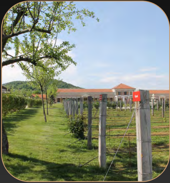
Library of varieties