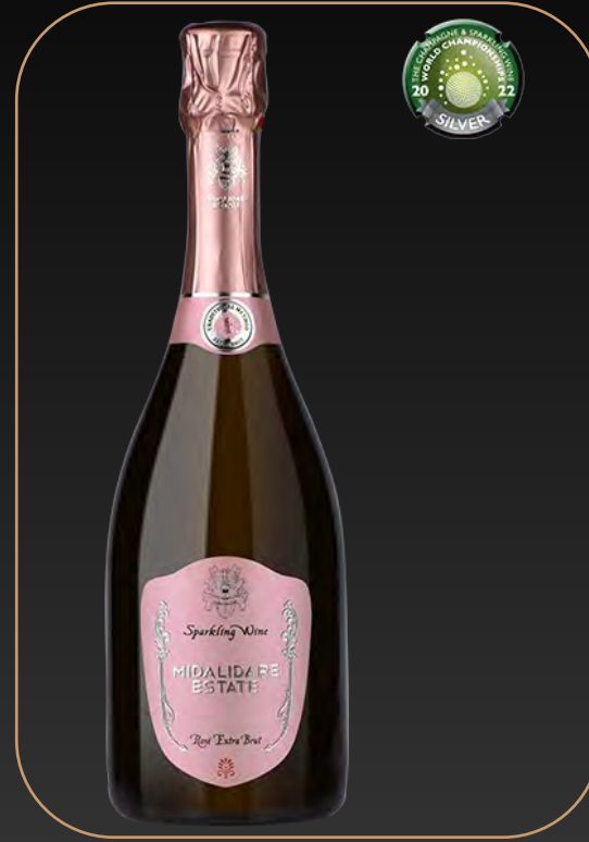
Midalidare Rosé Extra Brut NV