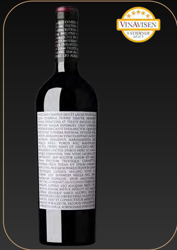
Carpe Diem Red