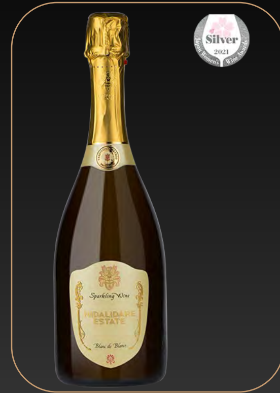
Midalidare Blanc de Blancs Brut NV