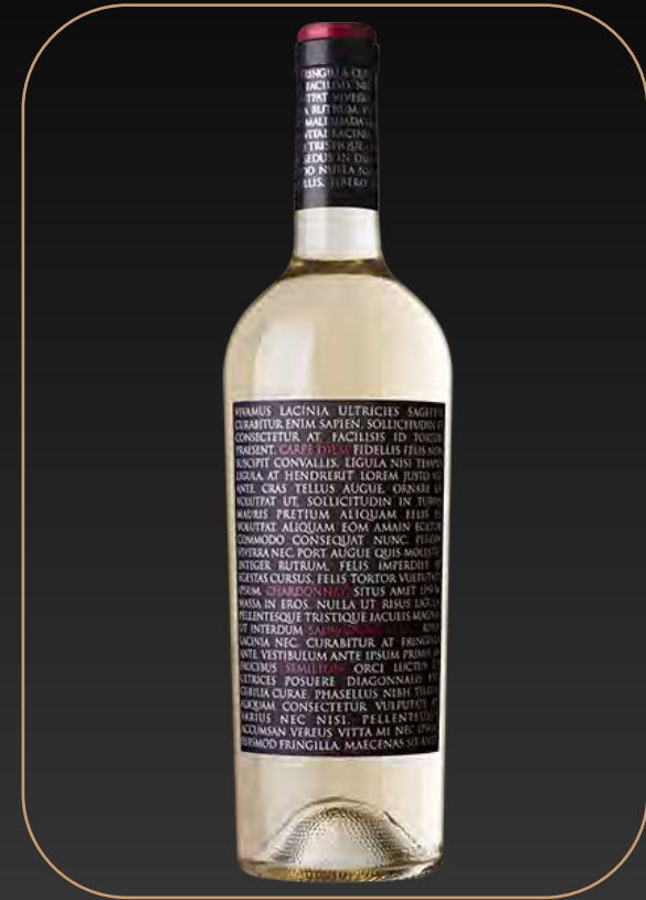
Carpe Diem White