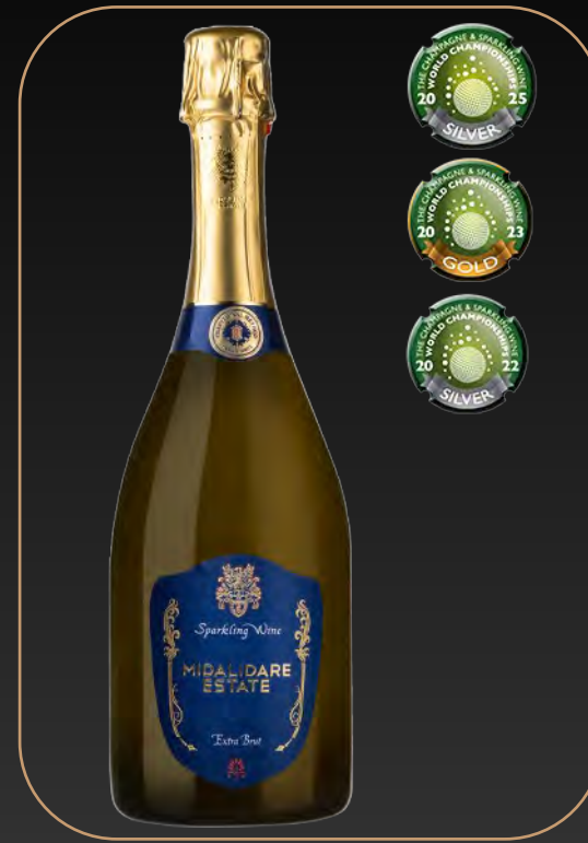
Midalidare Premier Extra Brut NV