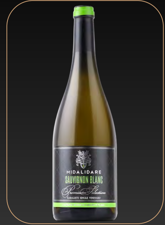
Premium Selection Sauvignon Blanc