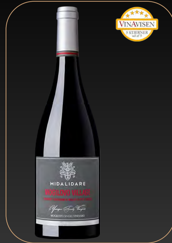
Mogilovo Village Cabernet & Merlot & Petit Verdot