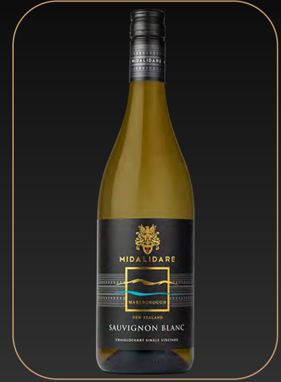
Midalidare New Zealand Marlborough Sauvignon Blanc