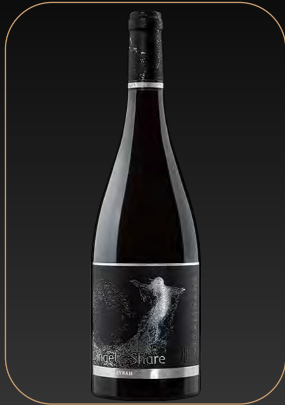
Angel's Share Syrah Regular & Half