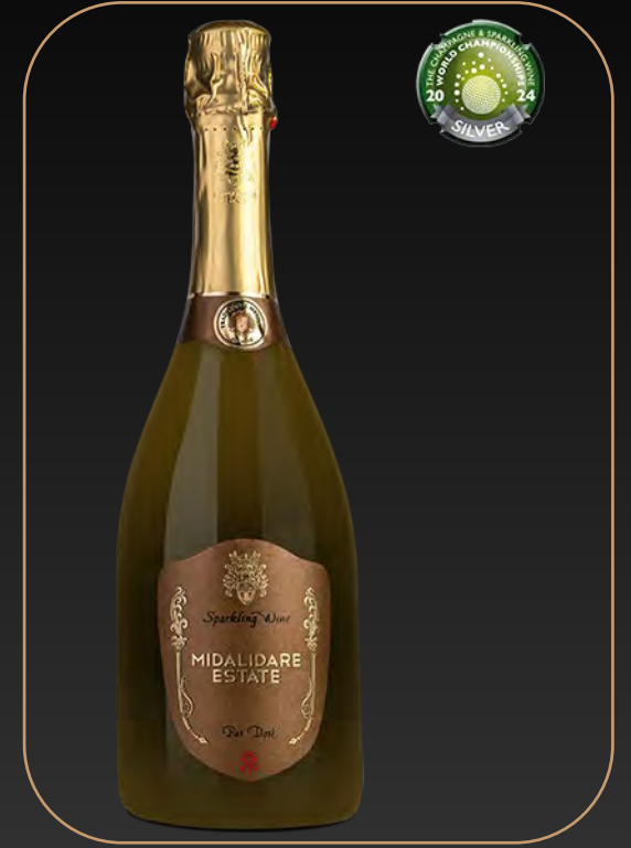
Midalidare Pas Dosé NV