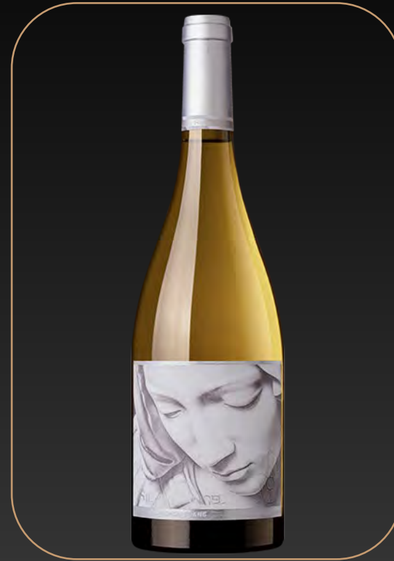
Silver Angel Sauvignon Blanc Regular & Half