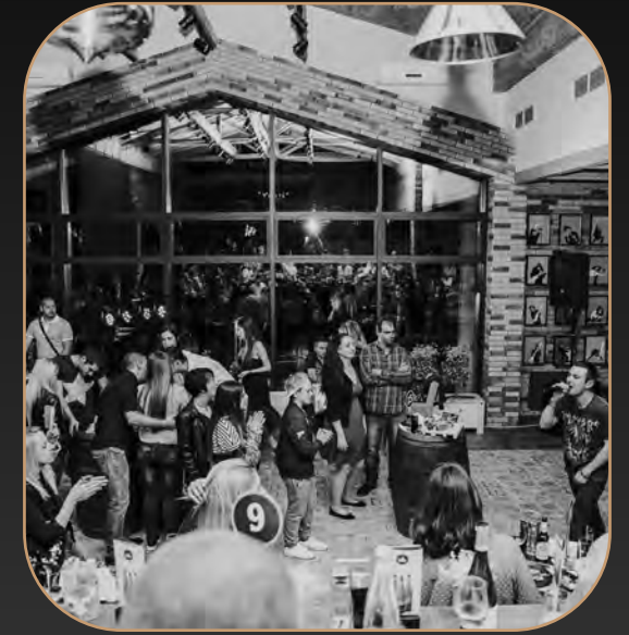
Live music events