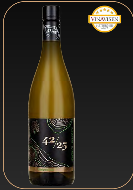
42/25 Sauvignon Blanc