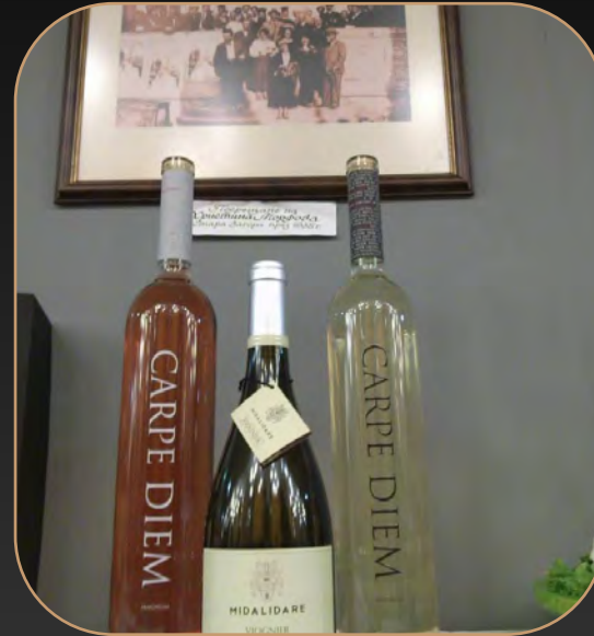
Charity "Christmas Eve for the Opera"