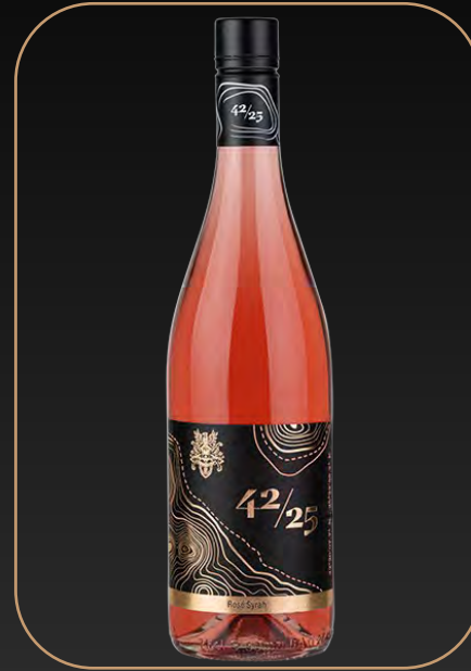
42/25 Rosé Syrah