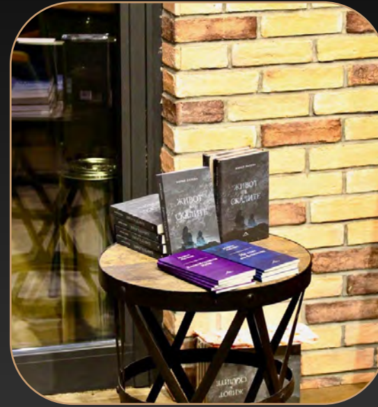
Wine and Book