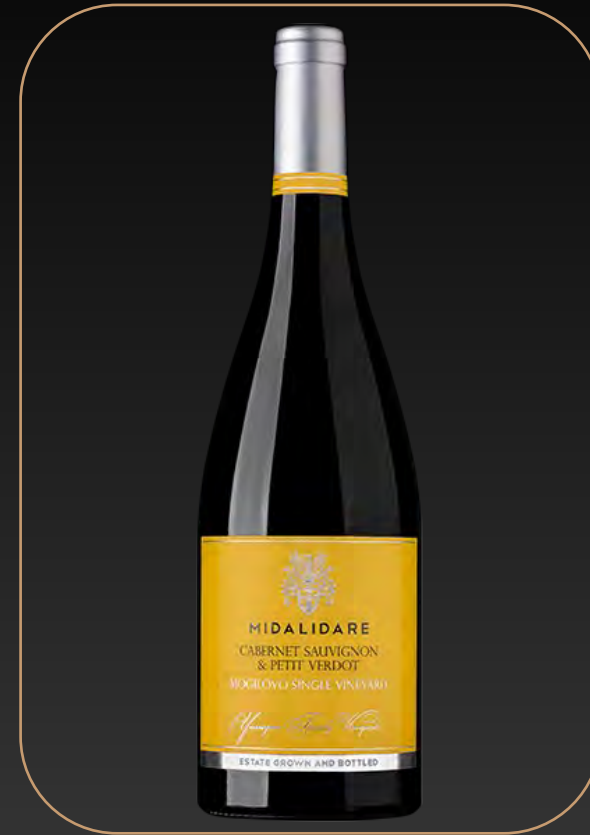
Midalidare Cabernet Sauvignon & Petit Verdot Regular & Half