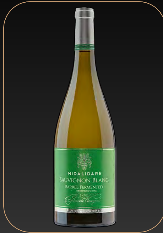
Winemaker's Choice Sauvignon Blanc Barrel Fermented