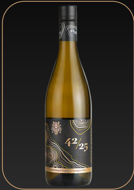
42/25 Chardonnay & Viognier & Sauvignon Blanc