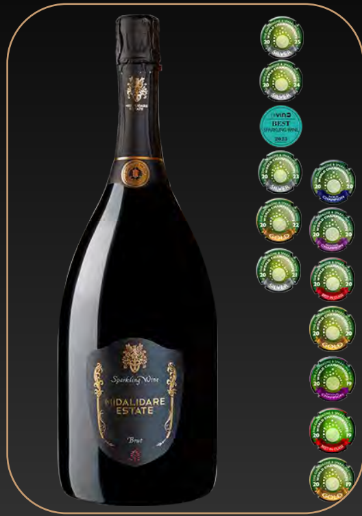
Midalidare Deluxe Brut NV Magnum