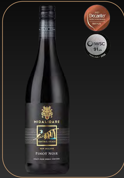
Midalidare New Zealand Central Otago Stag's Run Pinot Noir