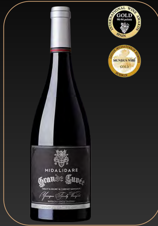
Grande Cuvee Regular & Magnum