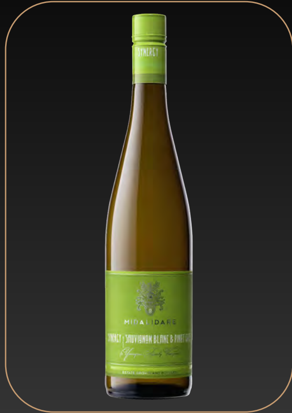
Synergy Sauvignon Blanc & Pinot Gris