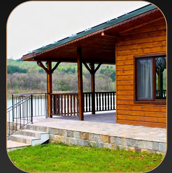
Mogilovo Dam Chalets