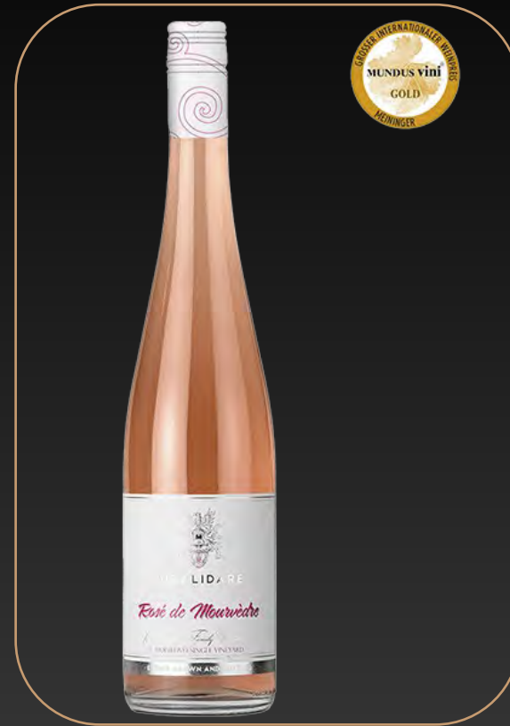
Rosé de Mourvedre