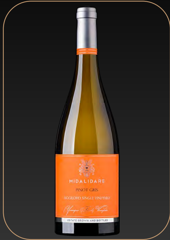
Midalidare Pinot Gris