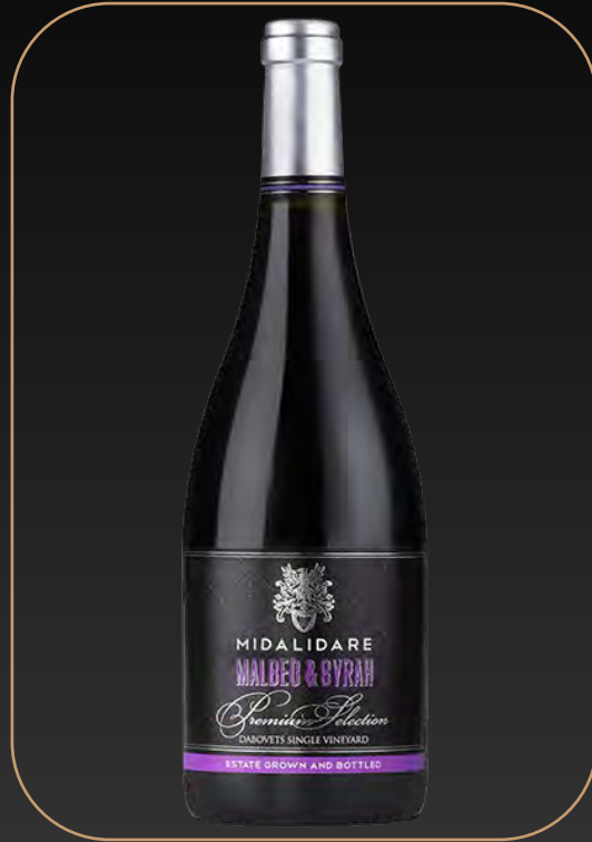
Midalidare Premium Selection Malbec & Syrah