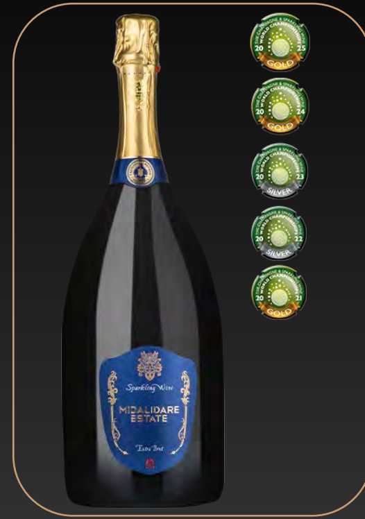
Midalidare Premier Extra Brut NV Magnum