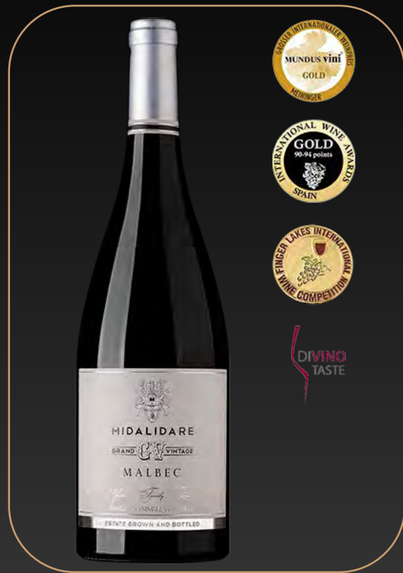
Grand Vintage Malbec Regular & Magnum