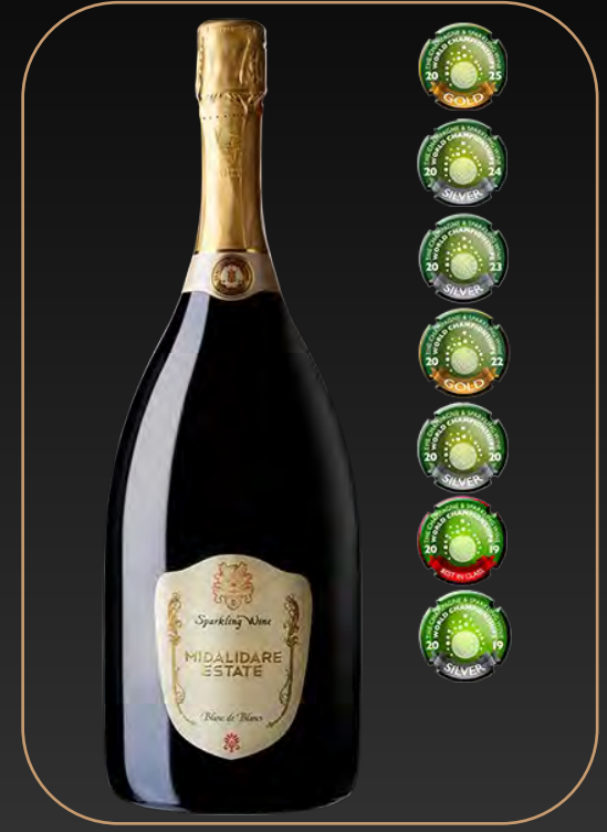
Midalidare Blanc de Blancs Brut NV Magnum