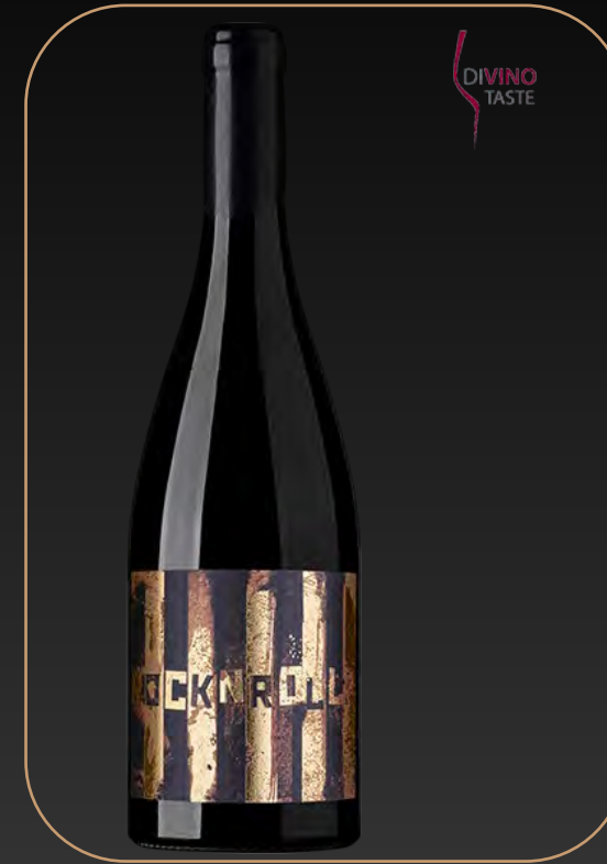
Rock'NRolla Regular & Magnum