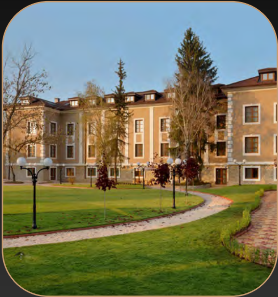
Midalidare Hotel & Spa