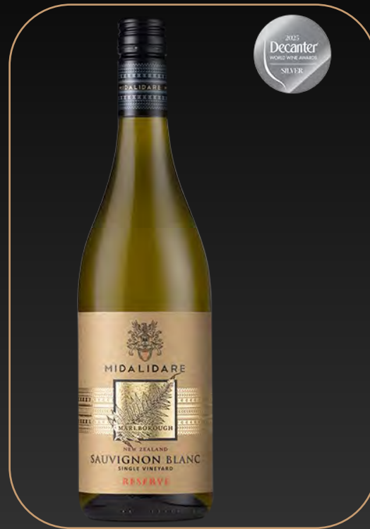
Midalidare New Zealand Marlborough Sauvignon Blanc Reserve