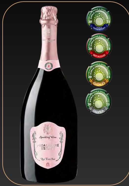
Midalidare Rosé Extra Brut NV Magnum