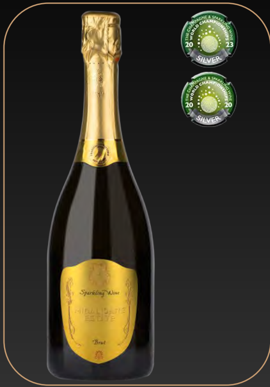
Midalidare Reserve Brut NV