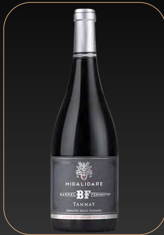
Midalidare Barrel Fermented Tannat