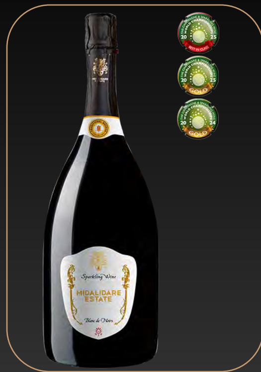
Midalidare Blanc de Noirs NV Magnum