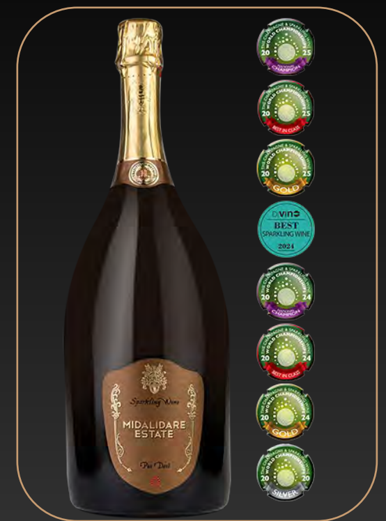
Midalidare Pas Dosé NV Magnum