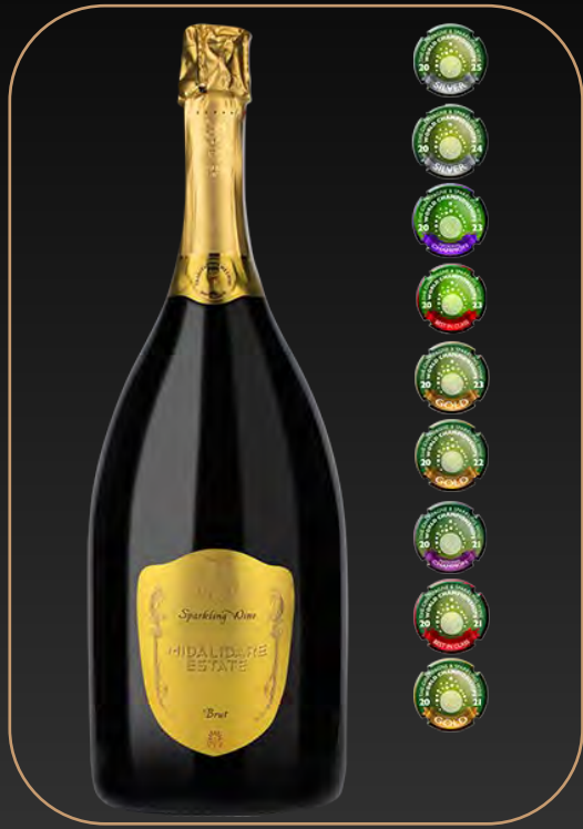
Midalidare Reserve Brut NV Magnum