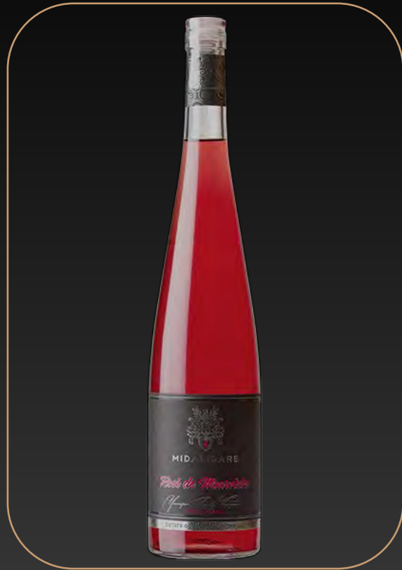
Rosé de Mourvedre Singe Barrel