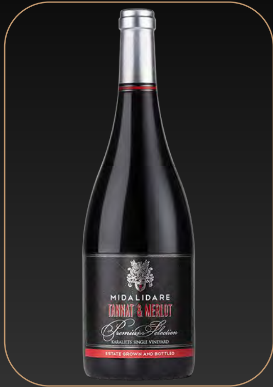
Premium Selection Tannat & Merlot