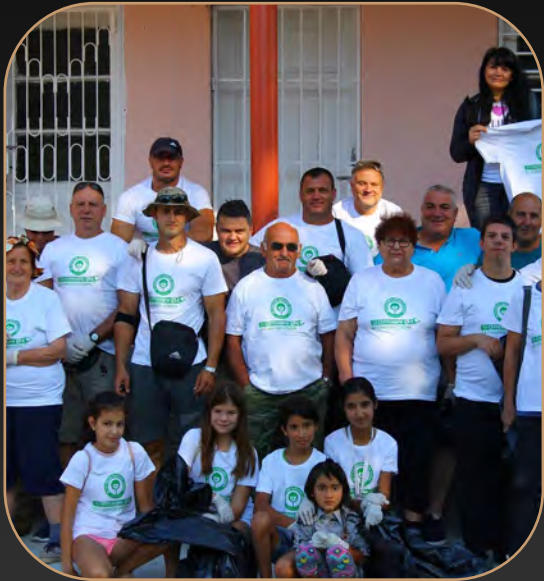
Let's clean Bulgaria together