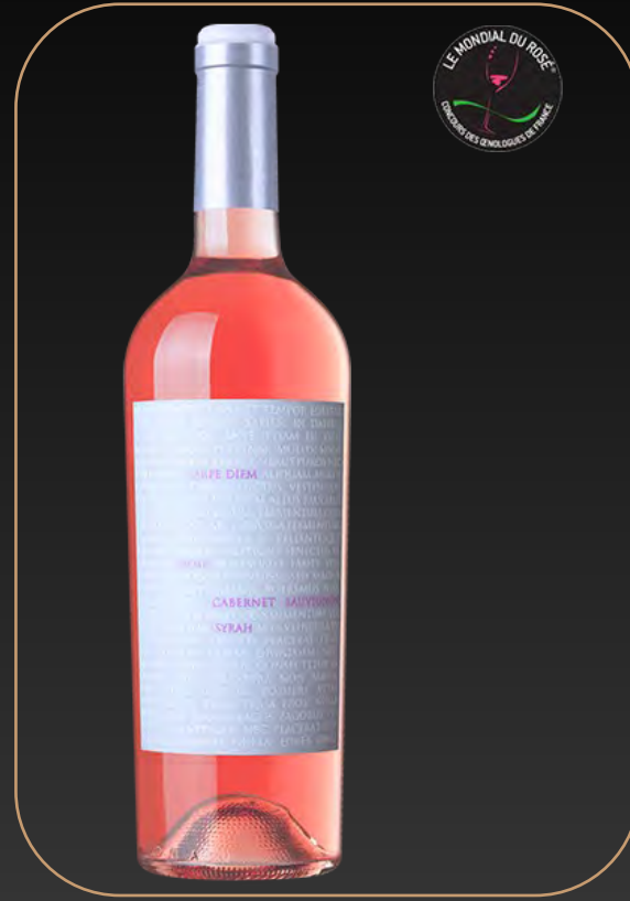
Carpe Diem Rosé