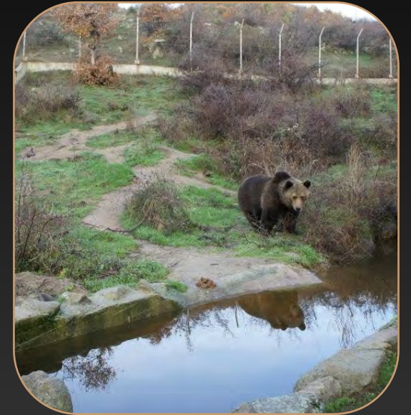
Let's build a new home for the bear Rosa