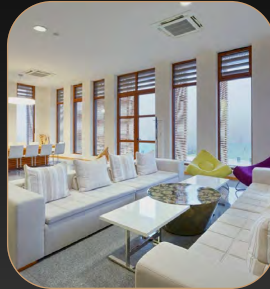
Estate Guest House