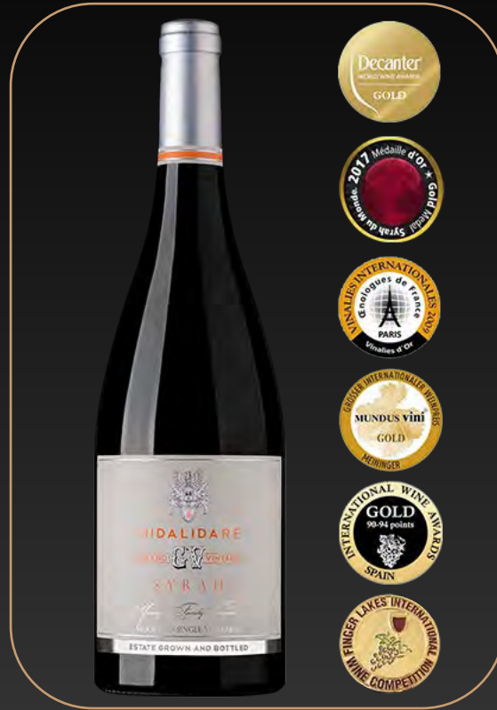
Grand Vintage Syrah Regular & Magnum