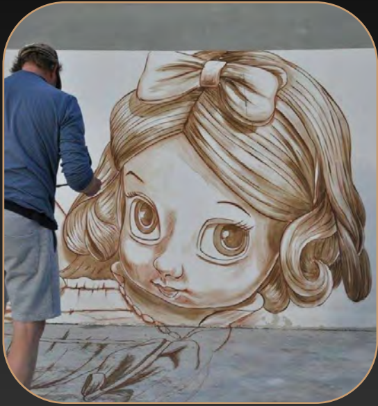
International 3D Street painting festival